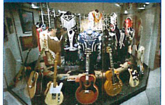
Country Music Hall of Fame.