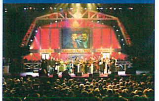
Famous Grand Ole Opry.

Departure: Walmart (old), 3021 1st Avenue E, Newton, IA @ 8 am