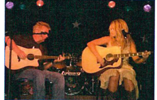
Nashville Nightlife Dinner Theater.