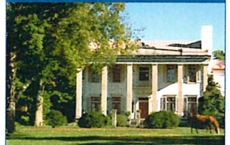
Belle Meade Historic Site & Winery.